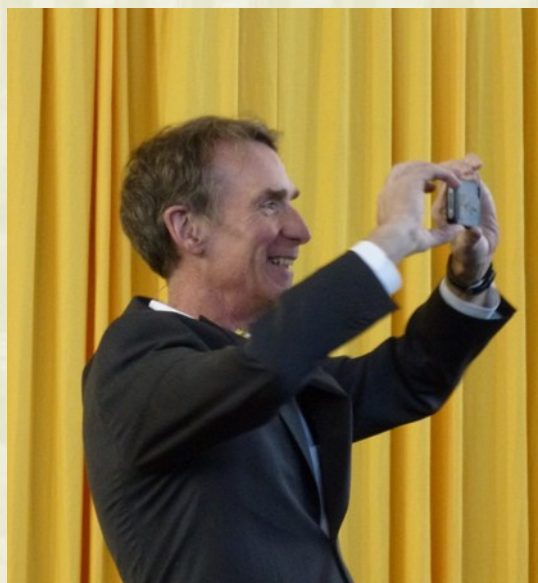
Bill Nye takes pictures of the audience taking pictures of him.