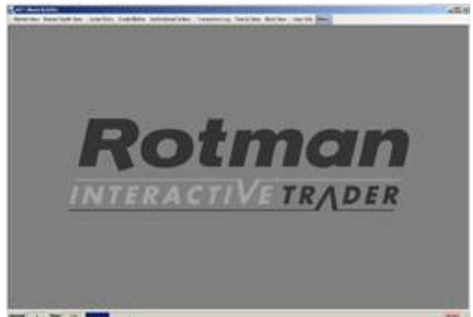
Example of an empty layout

For learning purposes, it is best to start with an empty layout. You can either individually close each module by clicking the X in the upper right corner of each module, or you can click the "Clear Interface" button located in the upper-right-hand corner of the RIT Client.