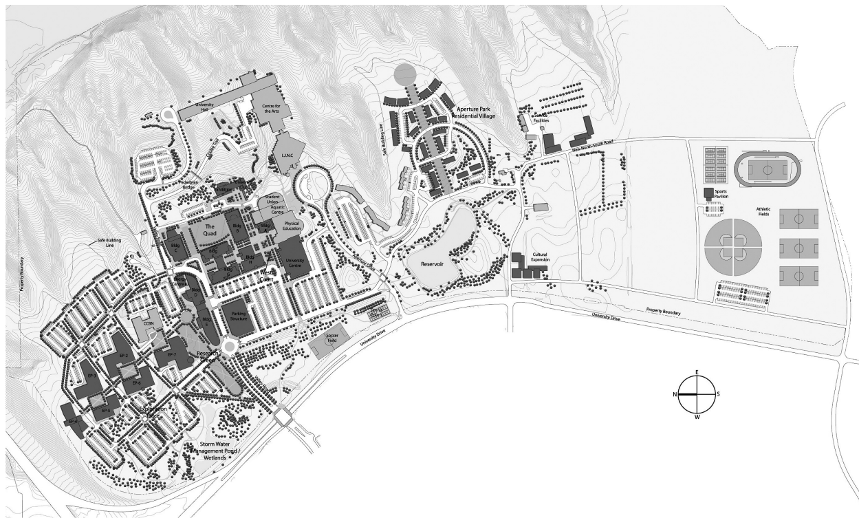
University of Lethbridge Core Campus Expansion Plan (2001) Brook McIlroy Planning + Urban Design

4401 University Drive Lethbridge, Alberta Canada T1K 3M4