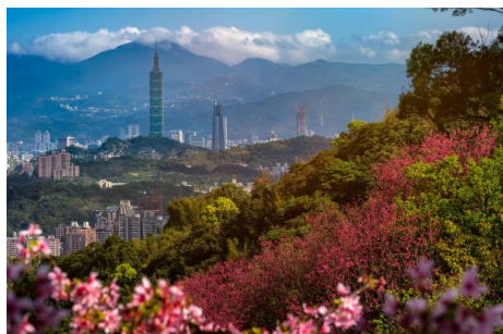
Taipei, Taiwan in springtime