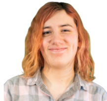
Raven She/They Townhomes