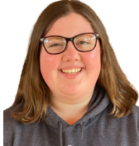
Brianna She/Her Townhomes