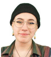
Em They/Them K3/4