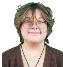
LJ They/Them BE