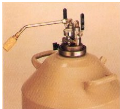
Figure 4. Dewar and Transfer tube.

When it is not safe or convenient to tilt the container, use a transfer tube to remove the liquid. Insert the transfer tube through the neck of the container and well down into the liquid. The packing material or stopper on the transfer tube should form a seal in the neck of the container. Normal evaporation usually produces enough pressure to push liquid out. If necessary, the container may be pressurized with the same gas as the liquid or with an oil-free inert gas. Use just enough pressure to force liquid out.