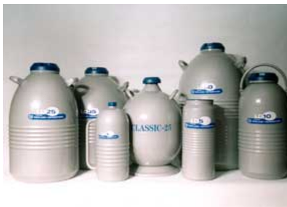
Figure 1. Dewar flasks.

2.1.1 Liquid Dewar Flasks. Liquid Dewar flasks are non-pressurized, vacuum-jacketed vessels, similar to a "Thermos bottle". They should have a loose fitting cap or plug that prevents air and moisture from entering, yet allows excess pressure to vent. Use only the stopper or plug supplied with the container.