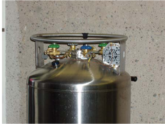
Figure 2. Pressurized Dewar flask (left); valve system (right).