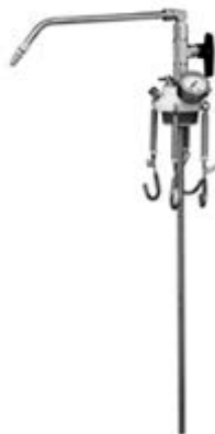
Figure 5. Transfer tube.