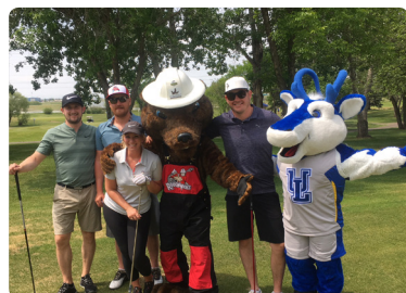
04 | Alumni News