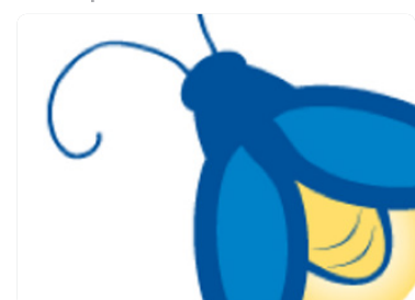
11 | Teaching Centre