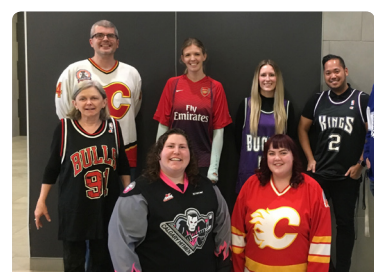
10 | Student Services