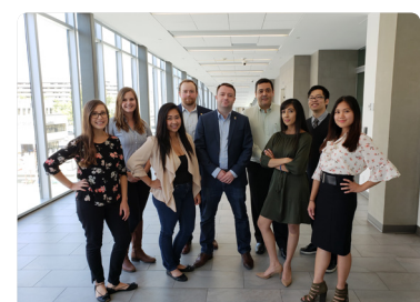
09 | Campus Clubs