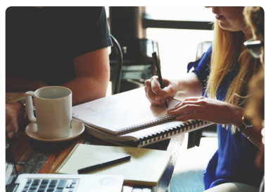
05 | Our Students continued