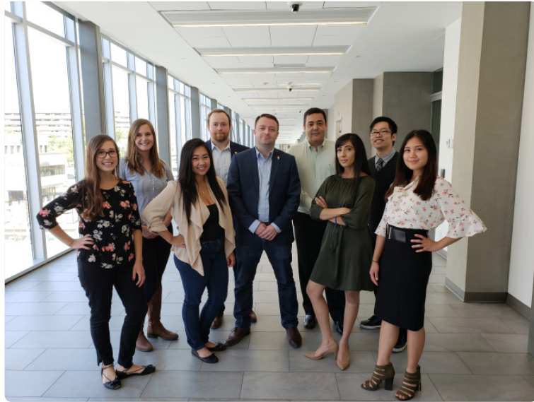
Calgary MSS Team 2018/2019

Our team is one that represents diversity and is inclusive to all. We aim to enrich and enhance the university experience for all students at the Dhillon School of Business – Calgary Campus.