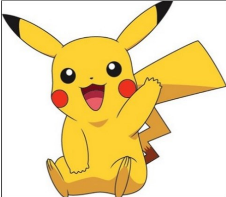
ピカチュウ Pikachu Nintendo

Based on state-of-the-art videoconferencing technology, Asian Studies 2850 brings together students and profs from Gakushuin Women's College in Tokyo and the University of Lethbridge to engage in interactive lectures and discussion in real time! Why? Because it's 2017.